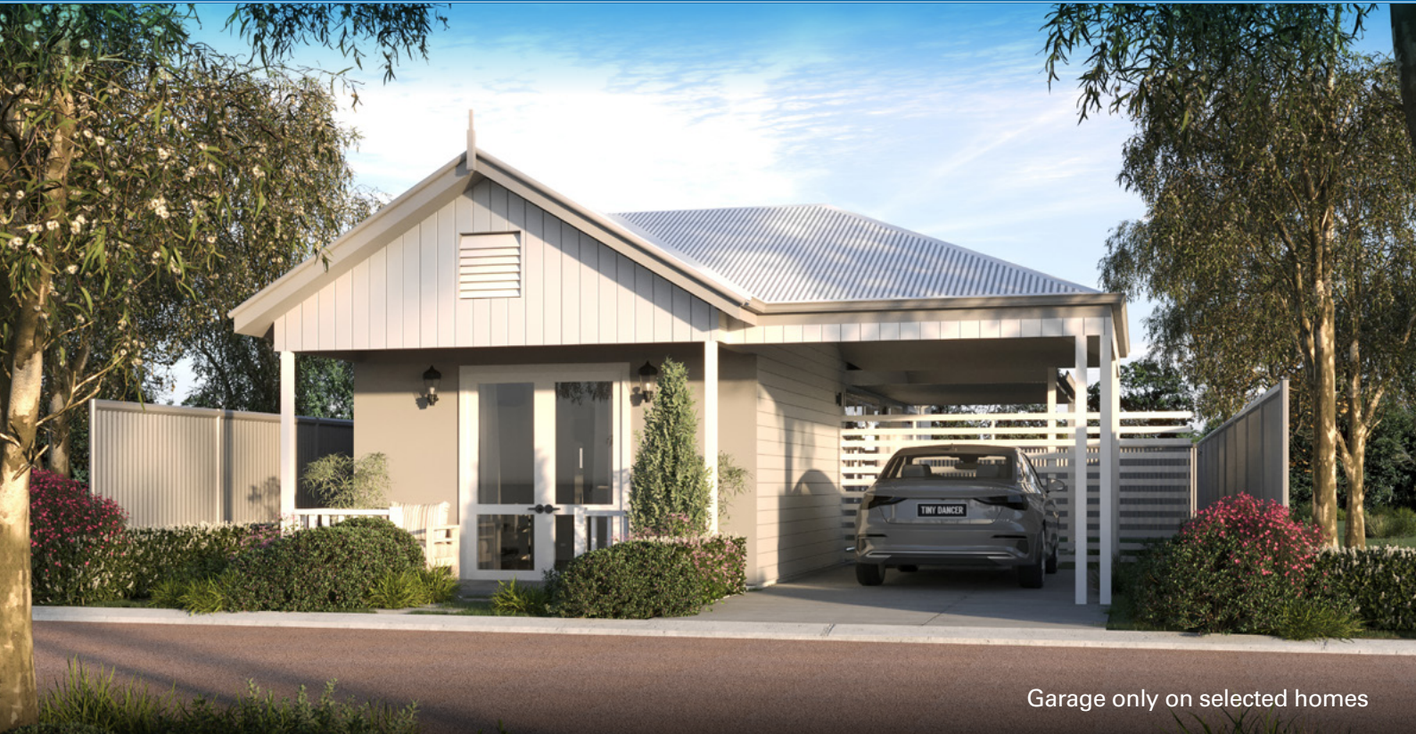
Garage only on selected homes

Providence Lifestyle Wattle Grove Resort