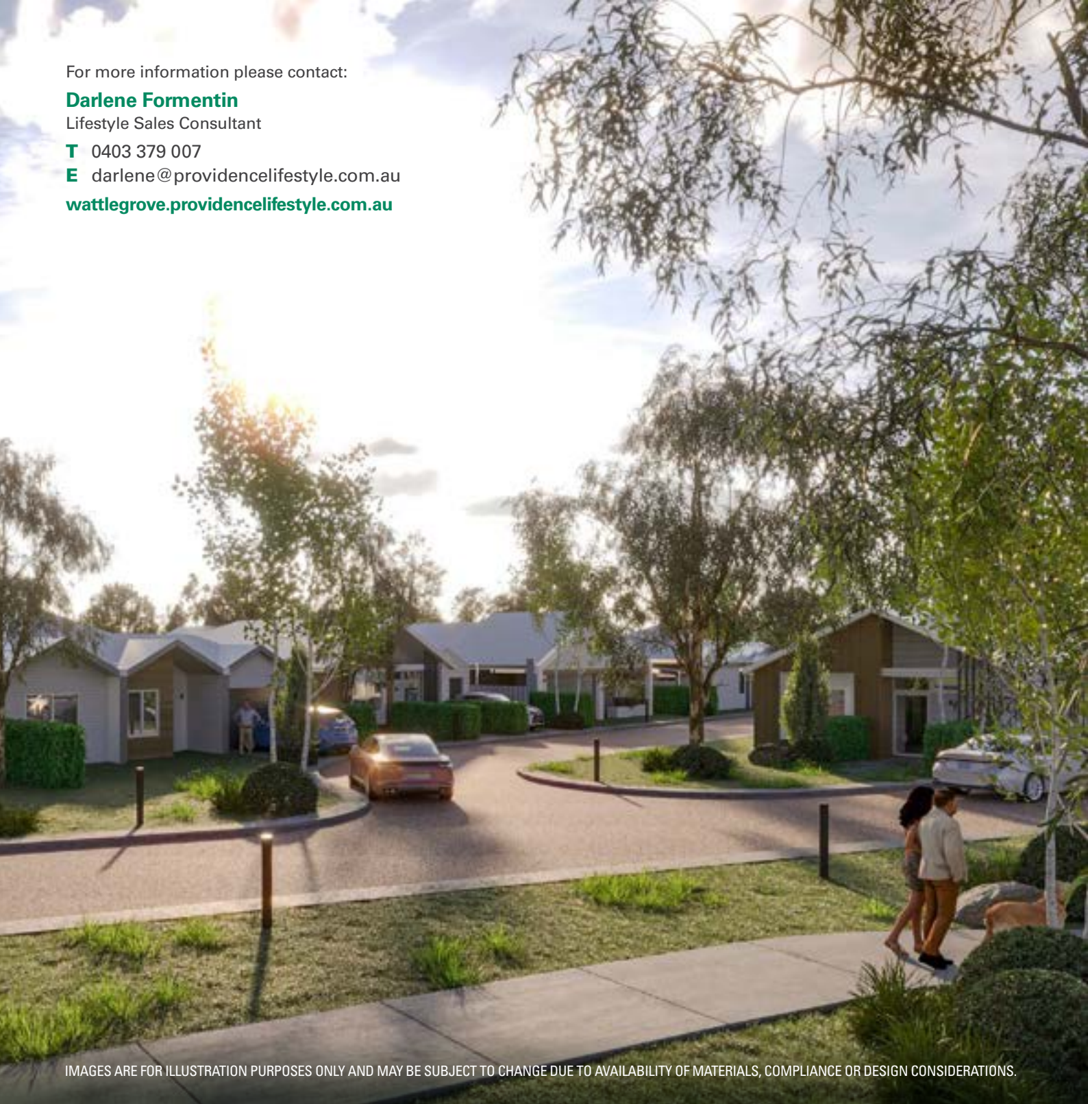
IMAGES ARE FOR ILLUSTRATION PURPOSES ONLY AND MAY BE SUBJECT TO CHANGE DUE TO AVAILABILITY OF MATERIALS, COMPLIANCE OR DESIGN CONSIDERATIONS.